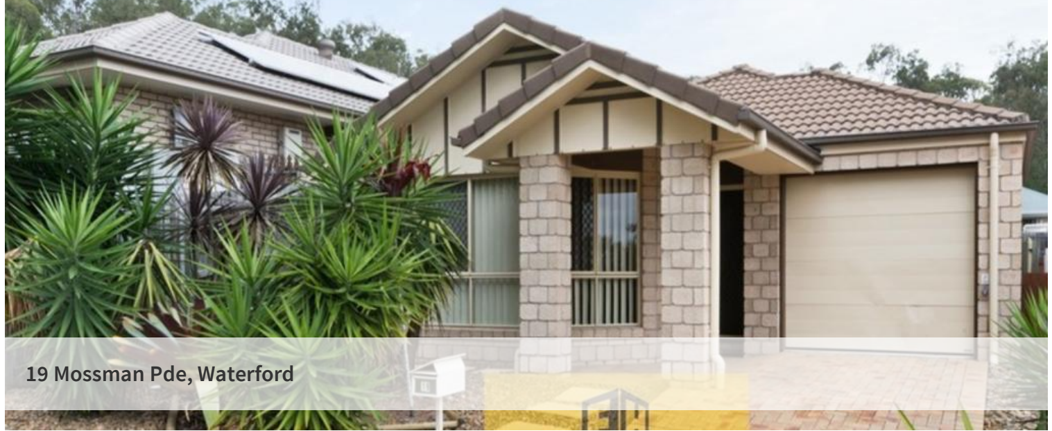
19 Mossman Pde, Waterford