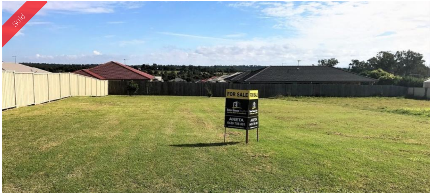
Lot 21 Macadamia Dr, Lowood